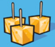
Cheese 50 g (1 ½ oz.)