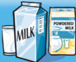
Milk or powdered milk (reconstituted) 250 mL (1 cup)