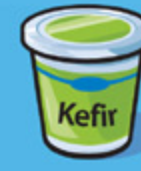
Kefir 175 g (¾ cup)