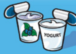
Yogurt 175 g (¾ cup)